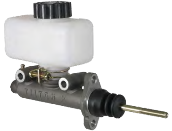
Diagram 1 - Master Cylinder Kit and Replacement Parts